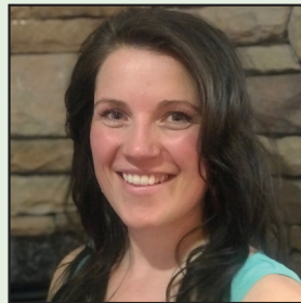
Cara Glen Truth, Purpose, Courage